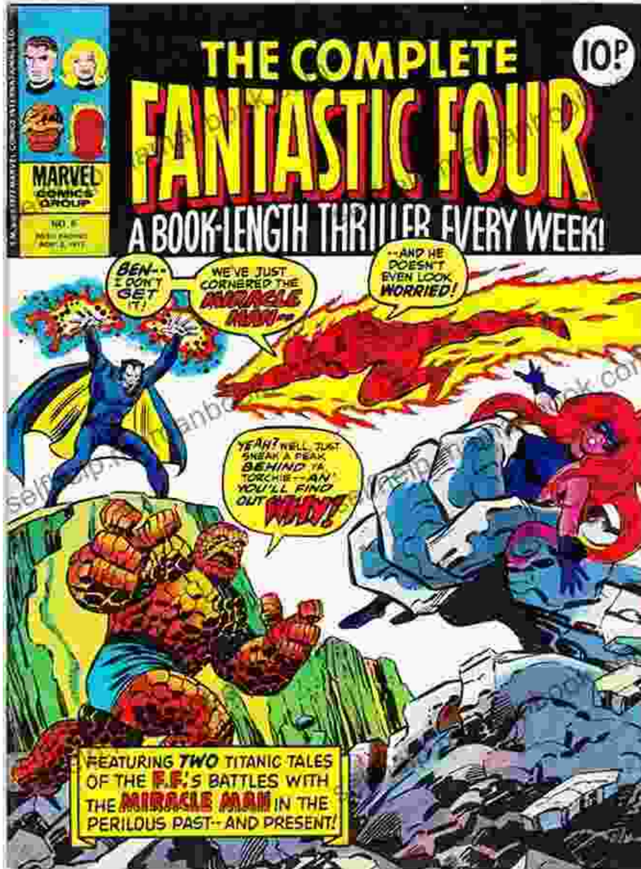
Fantastic Four #168 Cover Art (1977)