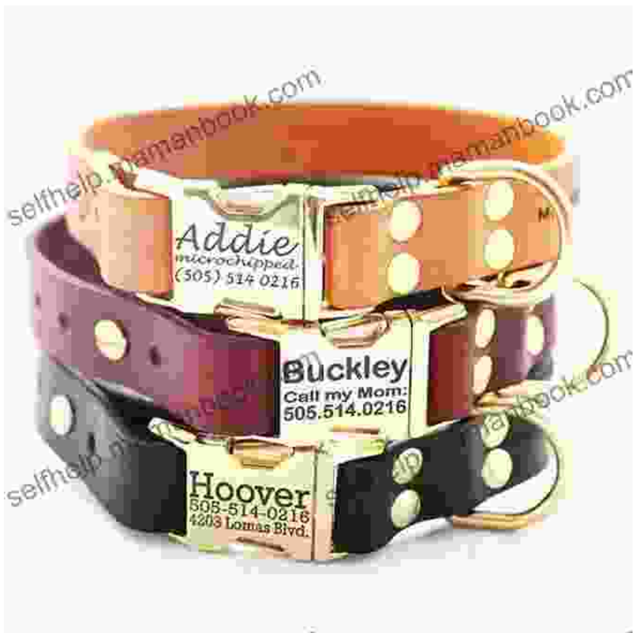
Image: A personalized pet collar made from leather and a metal tag.

Enhance your pet's everyday items with practical and personalized accessories. From durable collars to unique treats, these handmade creations add a touch of style and convenience to your pet's life.