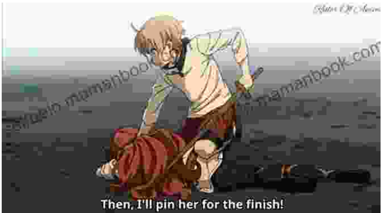
Action Scene from Mushoku Tensei

Mushoku Tensei: Jobless Reincarnation Light Novel Vol. 10 seamlessly blends riveting action sequences with poignant emotional moments. Battle scenes are rendered with cinematic flair, showcasing the strategic brilliance and devastating power of the characters.