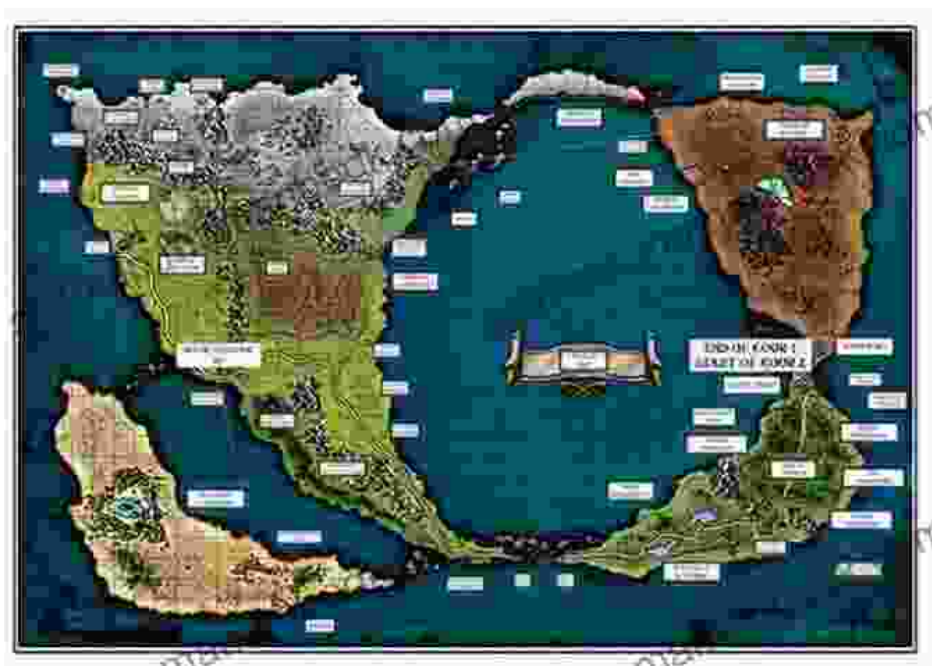
Mushoku Tensei: Jobless Reincarnation World Map

One of the most captivating aspects of Mushoku Tensei: Jobless Reincarnation Light Novel Vol. 10 is its meticulously crafted world. The author, Rifujin na Magonote, weaves a rich tapestry of cultures, lore, and geography, immersing the reader in a vibrant and believable setting.